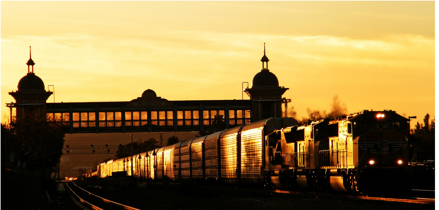
First Place, February 2017 - Pomona CA UP4193 SD70M: With the sun setting Union Pacific SD70M #4193 leads its mixed freight east through Pomona, CA having just passed beneath the pedestrian bridge at the Pomona Metrolink station. Notice the new signal bridge in the background that will soon be put into service.