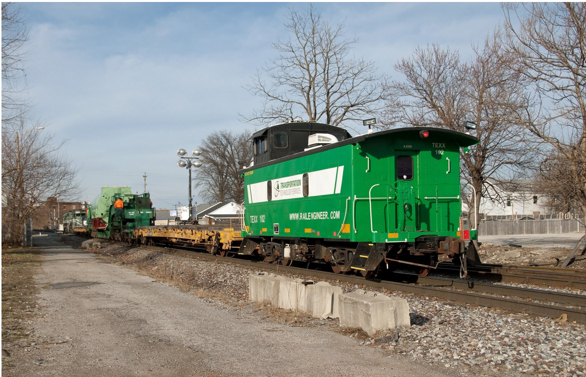
Second Place, February 2017 - A High/Wide Special that has spent the day coming up the P&L to Louisville, has interchanged with the NS and is about to enter the NS Youngtown Yard. The PAL units stayed with the Special into the NS Yard and returned light back to the PAL Oak Street Yard. It is not known where the Load went from here.